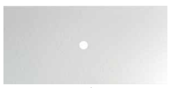
PIZARRA | LISO A 600-2000 | B 400-600