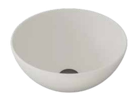
LISO ø400 h160